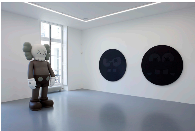
From left to right : Companion , 2010 Fiberglass painted / Fibre de verre peinte Bone to Pick , Give up the ghost , 2010 Acrylic on canvas/Acrylique sur toile