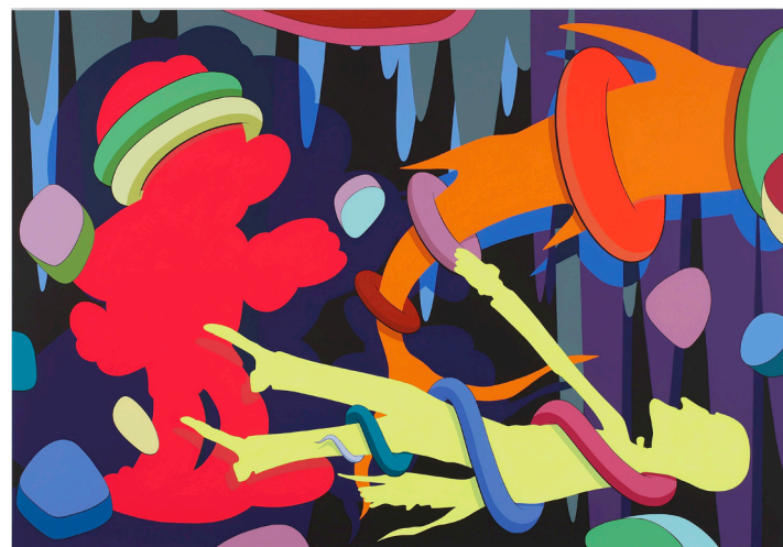
Pay the debt to nature 2010 Acrylic on canvas / Acrylique sur toile 84 x 120 inches / 213,3 x 304,8 cm