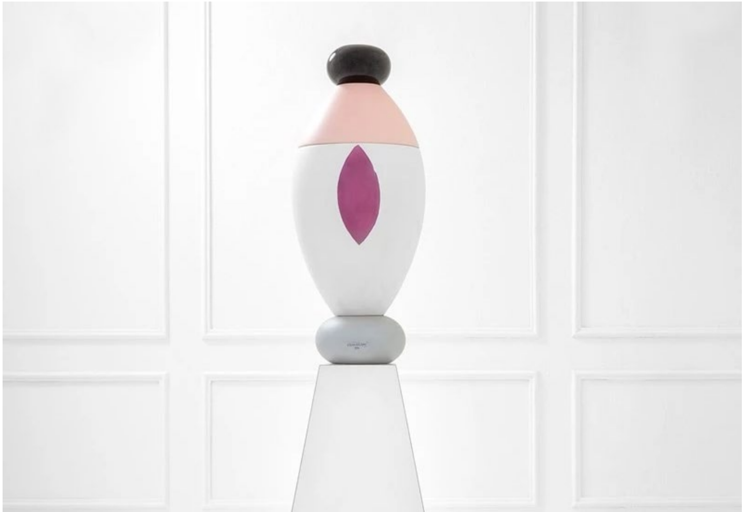
Ettore SOTTASS, 5A, 1994, Stoneware and wood, 190 × 58 × 58 cm | 74 13/16 x 22 13/16 x 22 13/16 inch. 3 P/A + edition of 20. © Ettore SOTTASS / ADAGP, Paris 2022.