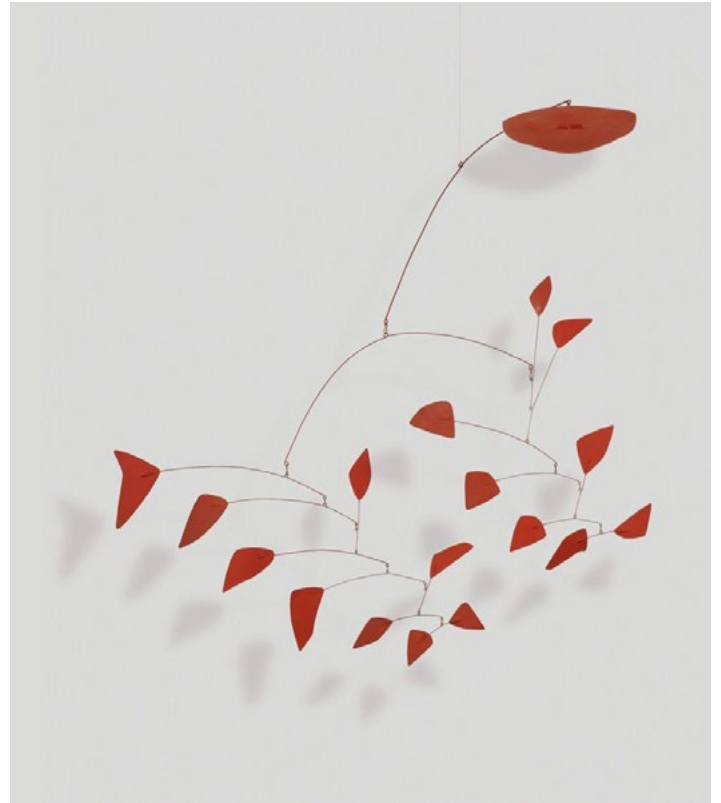
Alexander CALDER, Red Sumac , 1972. Sheet metal, wire, and paint, 114.3 × 170.2 × 33 cm | 45 × 67 × 13 inch, Unique. © Alexander Calder / ADAGP, Paris 2022.