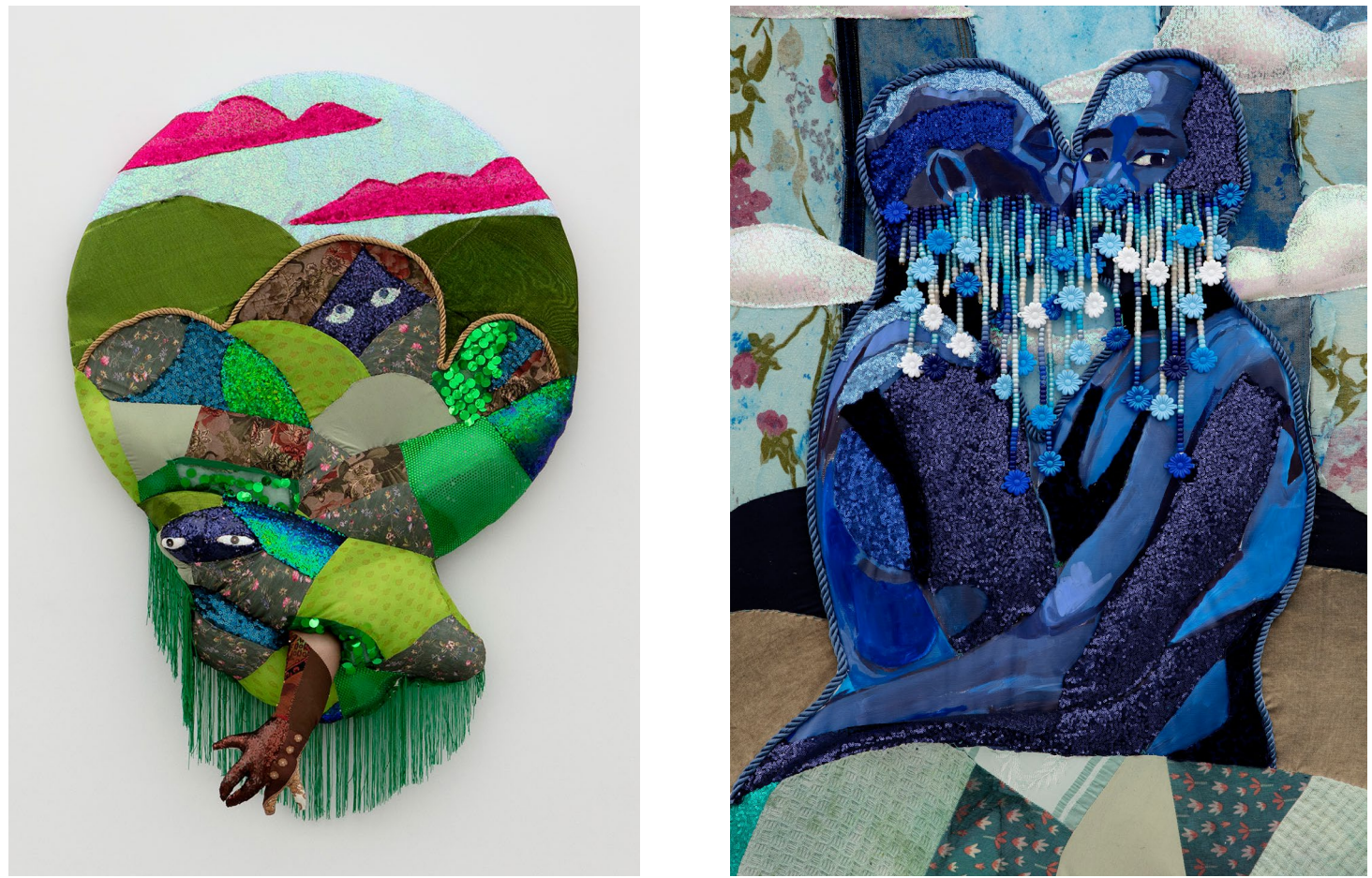
Left: Untitled, 2021. Oil on canvas and fabric stretched on panel. 53 x 36 1/4 x 11 in. Photographer: Guillaume Ziccarelli. Courtesy of the artist and Perrotin Right: Untitled (in blue) (detail), 2021. Oil on canvas, fabric stretched on panel, plastic beads & barrettes. 50 x 58.5 x 4 in. Photographer: Guillaume Ziccarelli. Courtesy of the artist and Perrotin

Upon entering the exhibition, visitors are greeted by a series of buoyant sculptures, unfurled across the central room of the exhibition. Immaterial (RIP Sophie ) is composed of accumulated fabric, wire, and found objects. Their appendages stretch widely – one arm is cloaked in the armor of a football player, while the other is costumed in a flamboyant Medieval sleeve – and a golden mask sits atop their head, looking upwards. Underneath them, Latin has constructed a pedestal from salvaged building materials.