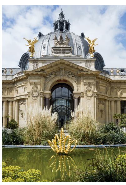
Jean-Michel Othoniel, Gold Lotus, 2019