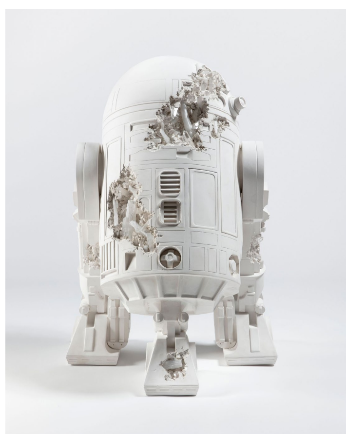
Daniel Arsham. R2 -D2™: Quartz Crystallized Figure , 2023. Quartz, Selenite, Hydrostone. 48 × 42 <sup>1/16</sup> × 42 <sup>1/16</sup> in. © & ™ Lucasfilm Ltd. © 2023 Daniel Arsham, Inc.