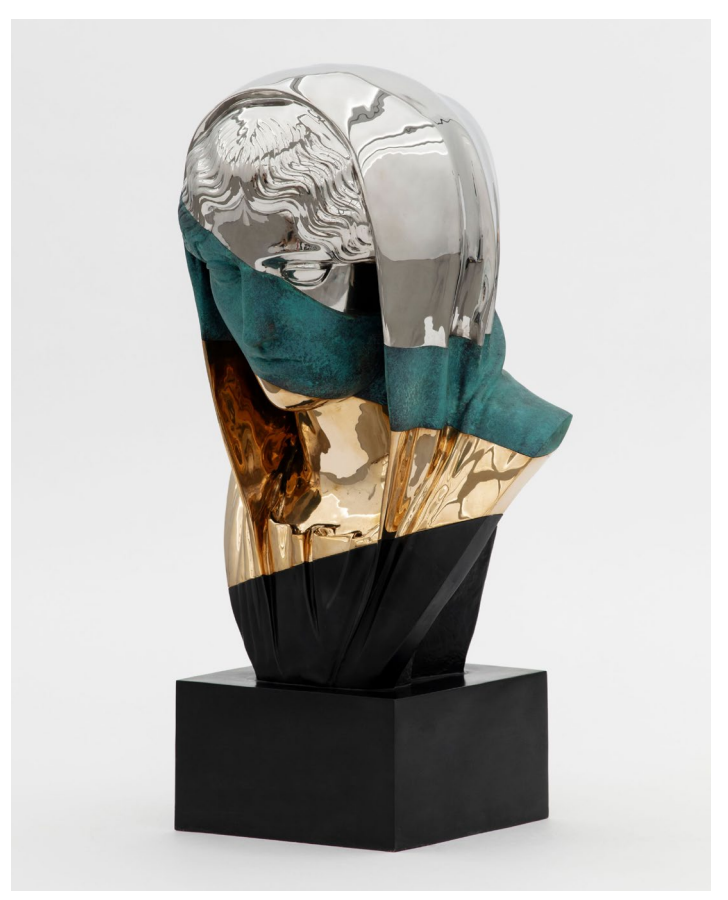
Daniel Arsham. Amalgamized Bust of Veiled Woman , 2023. Stainless Steel, Patinated Bronze, Polished Bronze. 39^{3/8} \times 19^{3/8} \times 21^{7/8} in.