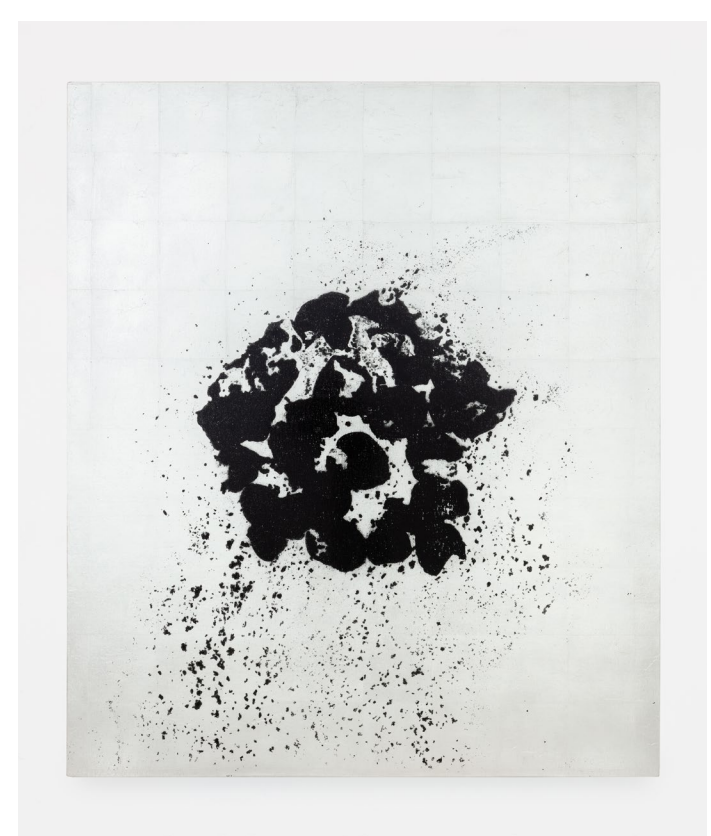
Bouton Rose, 2020. Painting on canvas, black ink on white gold leaf. 84 x 72 x 5 cm. Photographer: Tanguy Beurdeley. Courtesy of Othoniel Studio and Perrotin. ©Jean-Michel Othoniel / ADAGP, Paris & ARS, New York, 2021