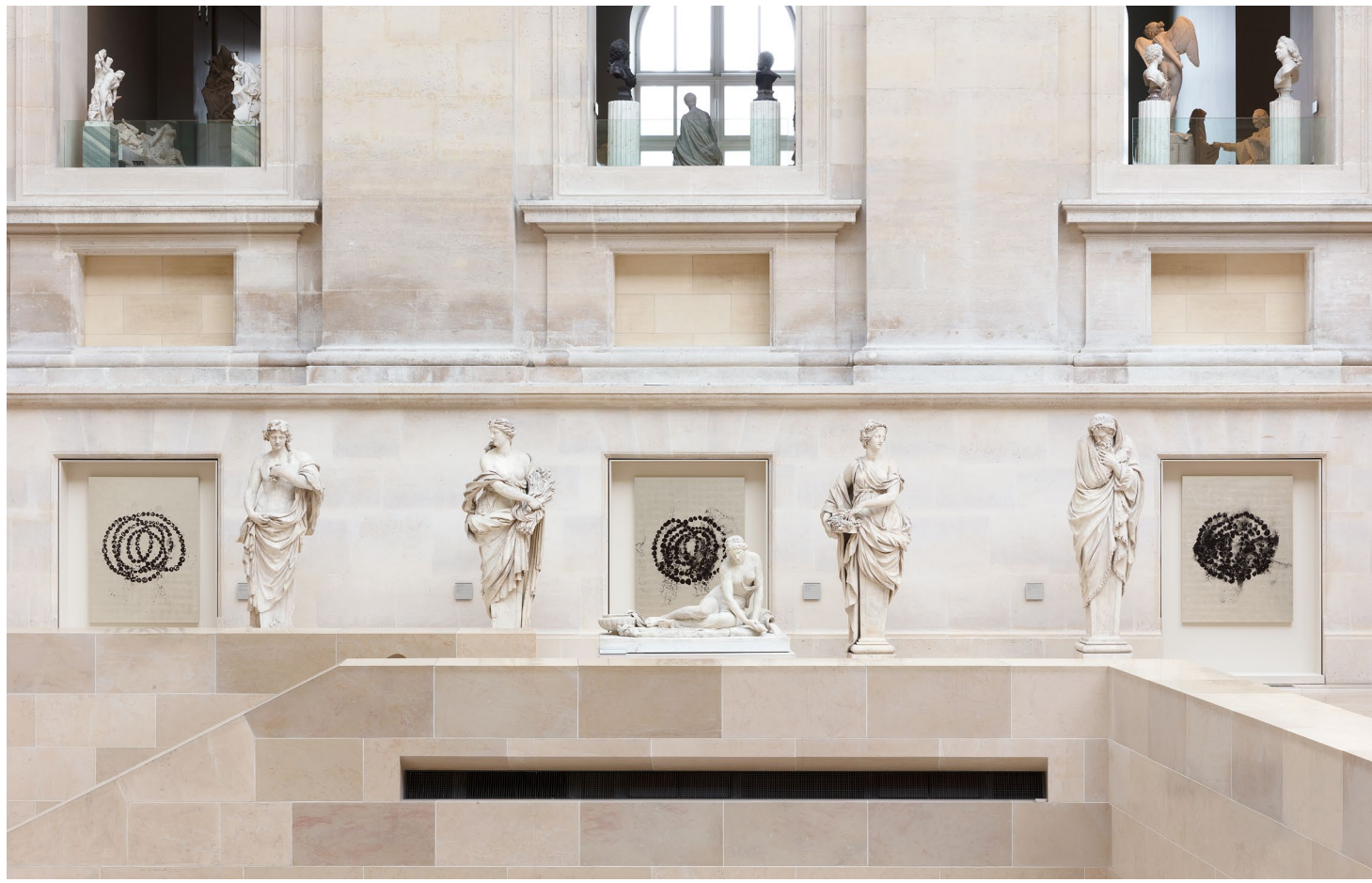
View of the permanent installation «La Rose du Louvre» in the Musée du Louvre collection, Paris (France), 2020.

Wild Rosebuds is a continuation of Jean-Michel Othoniel's decades-long fascination with flowers as a conceptual and aesthetic framework for his fine art practice. In his early work, Othoniel buried anemones in sulphur, cut and dissected pomegranates, and pinned flower petals to the walls. In 1996, Othoniel produced a series of larger-than-life lady-slipper orchids in Murano glass and hung them from the trees dotting the Peggy Guggenheim estate in Venice, Italy, and later, hid his immense necklaces inside the cavernous oaks in New Orleans, Louisiana. In 2015, the artist published a book titled "the secret language of flowers," in collaboration with the Isabella Stewart Gardner Museum, which was republished in dialogue with the Louvre collections in 2020. In a 2015 interview, he stated "Flowers are our primary images." He went on to reveal that "since adolescence, I amassed a stock of notes on this history of plants" as well as an exhaustive photographic archive of both flowers and trees. With their infinite symbolic associations, flowers allow Othoniel to explore his concerns with ephemerality and permanence, life and death, figure and ground, as well as form and color. For the artist, flowers have evolved into a "way of looking at the world."