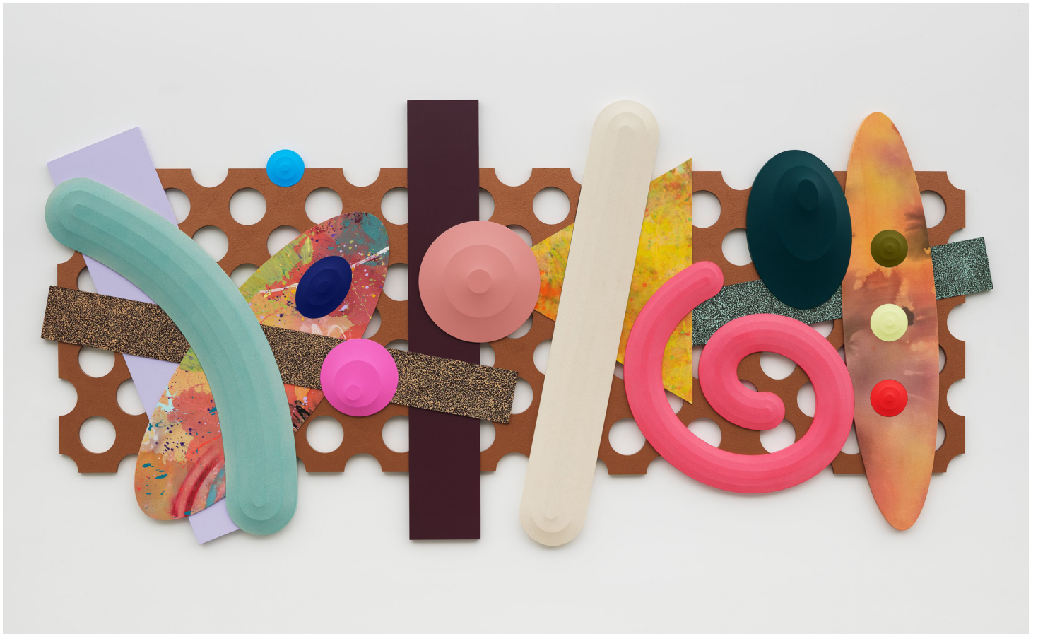
Fried Paradise , 2020. 布面丙烯, 板上丙烯, 板上瓷釉 | Acrylic on canvas, acrylic on panel, hammered enamel on panel. 150 x 320 cm.

试选择了最浅的色调与渐变的色彩效果, 甚至将画布上的颜色完全去除。没有了色彩的干预, 观众将于毫无阻碍的情况下审视形式主义者在结构中设下的谜团——这意味着惊人的进步, 在同等程度上也意味着不可思议的大胆和沉着。