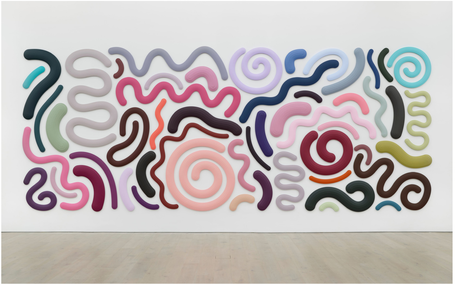
Birds of Paradise , 2020. 布面丙烯 (53个组件) | Acrylic on canvas (53 elements). 319 x 796 cm.