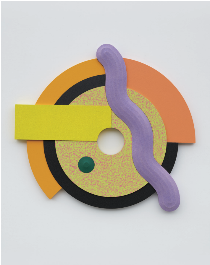
Follow the Leader C , 2020. 布面丙烯, 板上丙烯, 板上瓷釉 | Acrylic on canvas, acrylic on panel, hammered enamel on panel. 84 x 77.5 cm.