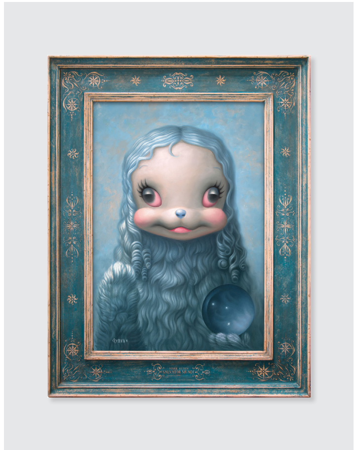
Salvator Mundi (#137), 2018. 木板油画、手工木框 | Oil on panel and hand-carved wood frame. 88.3 x 67.9 x 4.4 cm. 图片提供: 艺术家、贝浩登与卡斯明 | Courtesy of the Artist, Perrotin and Kasmin

村上隆曾说道：“马克·莱登，奈良美智与我，以及我们同时代的艺术家都面临着相同的方向。这种方向是指，我们还是孩子的时候，浸润于亚文化的影响下，这种经历深深地烙印在我们每个人身上；到青少年时期，我们开始绘画及研究艺术史，同时发展我们的绘画技巧。当我们能够完全掌握两者时，我们便成功将历史绘画方法与亚文化结合。简而言之，这就是我们这一代。”