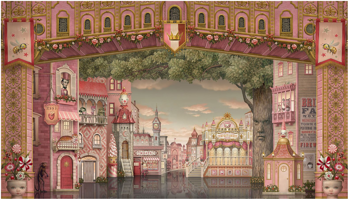
The City , 2017. 档案纸艺术微喷 | Giclee print on archival paper. 81.3 x 127 cm.