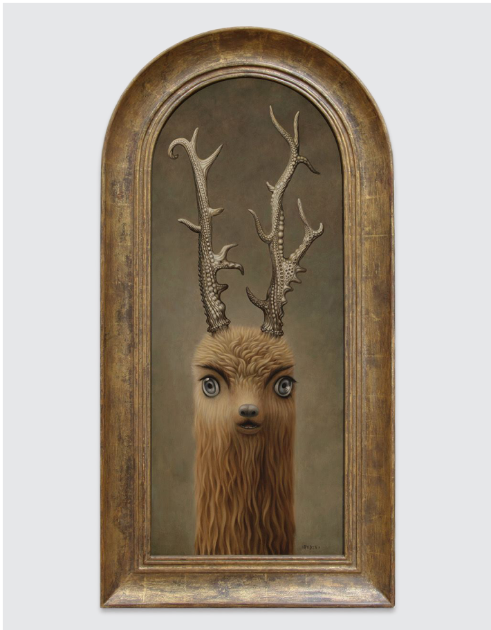
Messenger (#148), 2019. 木板油画、手工木框 | Oil on panel and hand-carved wood frame. 120.7 x 59.7 x 7.6 cm.