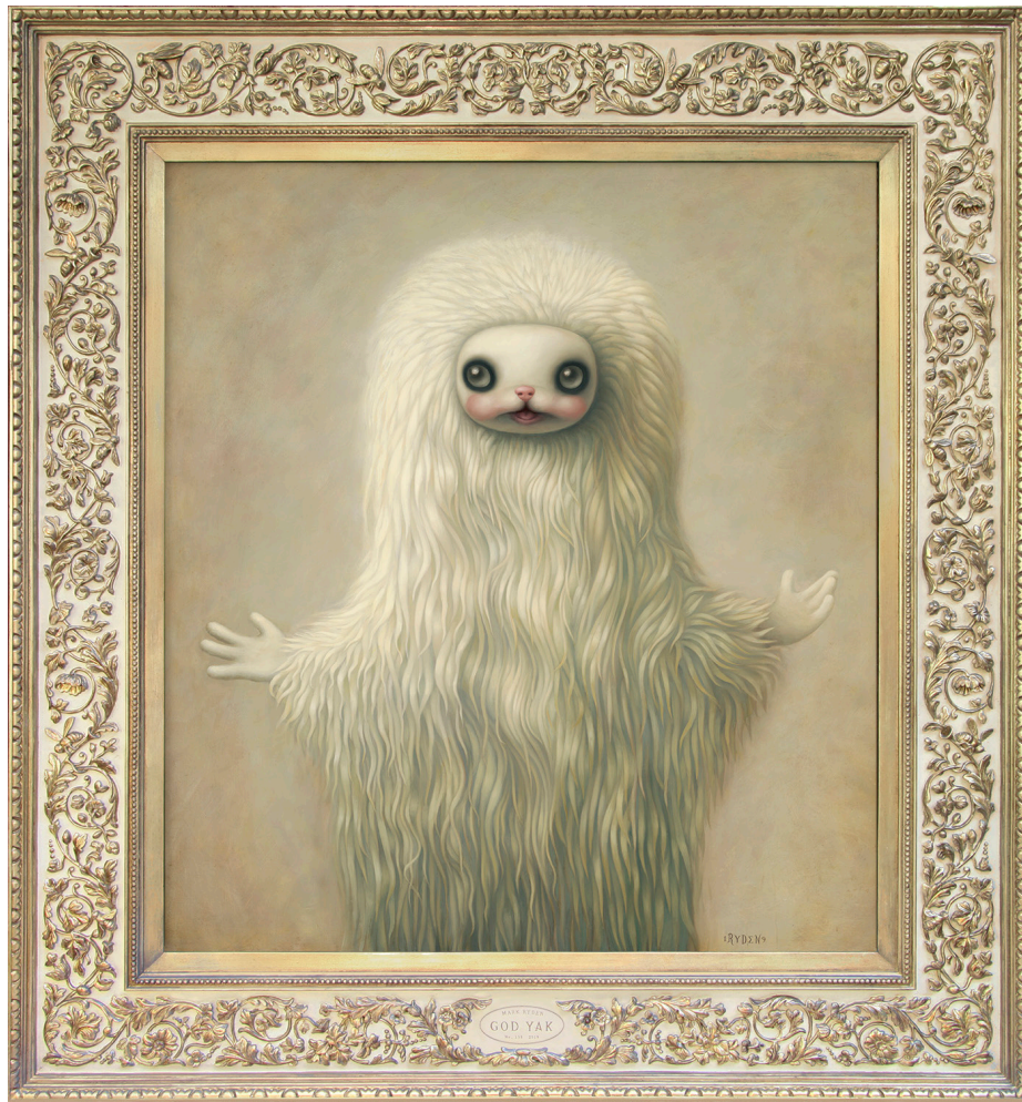
God Yak (#138) , 2019. 布面油画, 手工木框 | Oil on canvas and hand-carved wood frame. 137.2 x 127 x 6.7 cm.