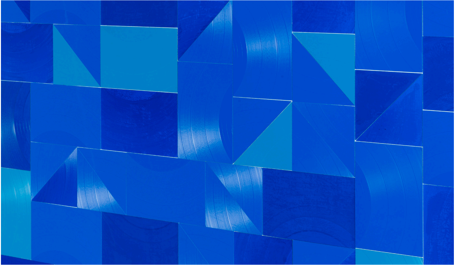
Ins Blaue (detail), 2018. Cut vinyl records, acrylic, canvas, wood 192 x 140 x 4.1 cm | 75.6 x 55.1 x 1.6 in