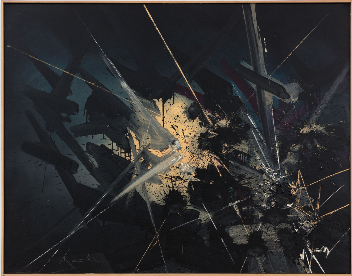
Georges Mathieu Composition 326 , 1989 – 1990. Oil on canvas. 114 × 146 cm | 44 7/8 × 57 1/2 in. © Georges Mathieu / ADAGP, Paris, 2019. Courtesy of the artist & Perrotin.