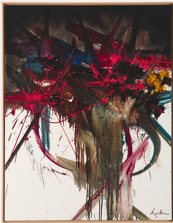
Georges Mathieu Confusion dévoilée (Confusion unveiled) , 1987. Oil on canvas. 145 × 114 cm | 57 1/16 × 44 7/8 in.