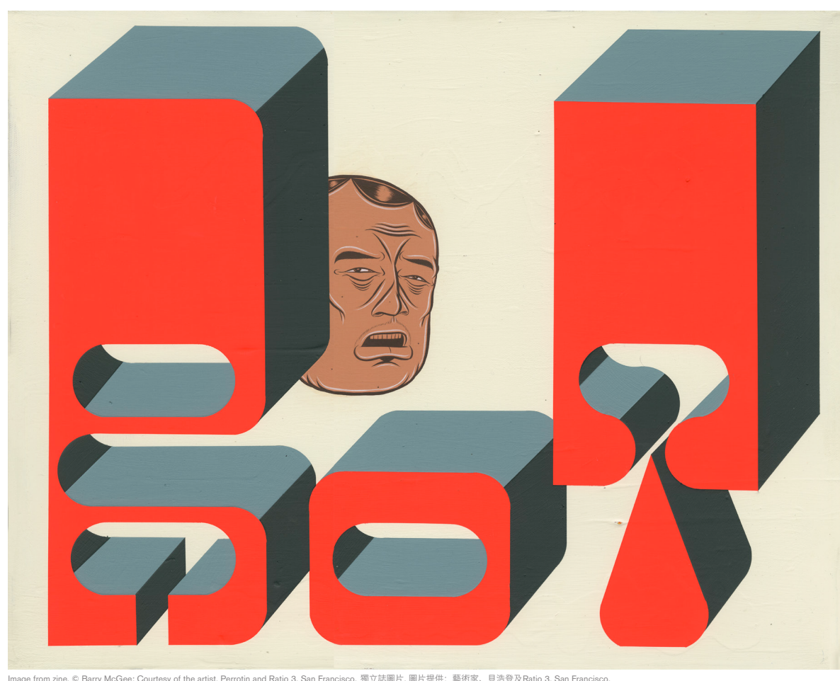
Image from zine. © Barry McGee: Courtesy of the artist. Perrotin and Ratio 3. San Francisco. 獨立誌圖片, 圖片提供: 藝術家、貝浩登及Ratio 3. San Francisco