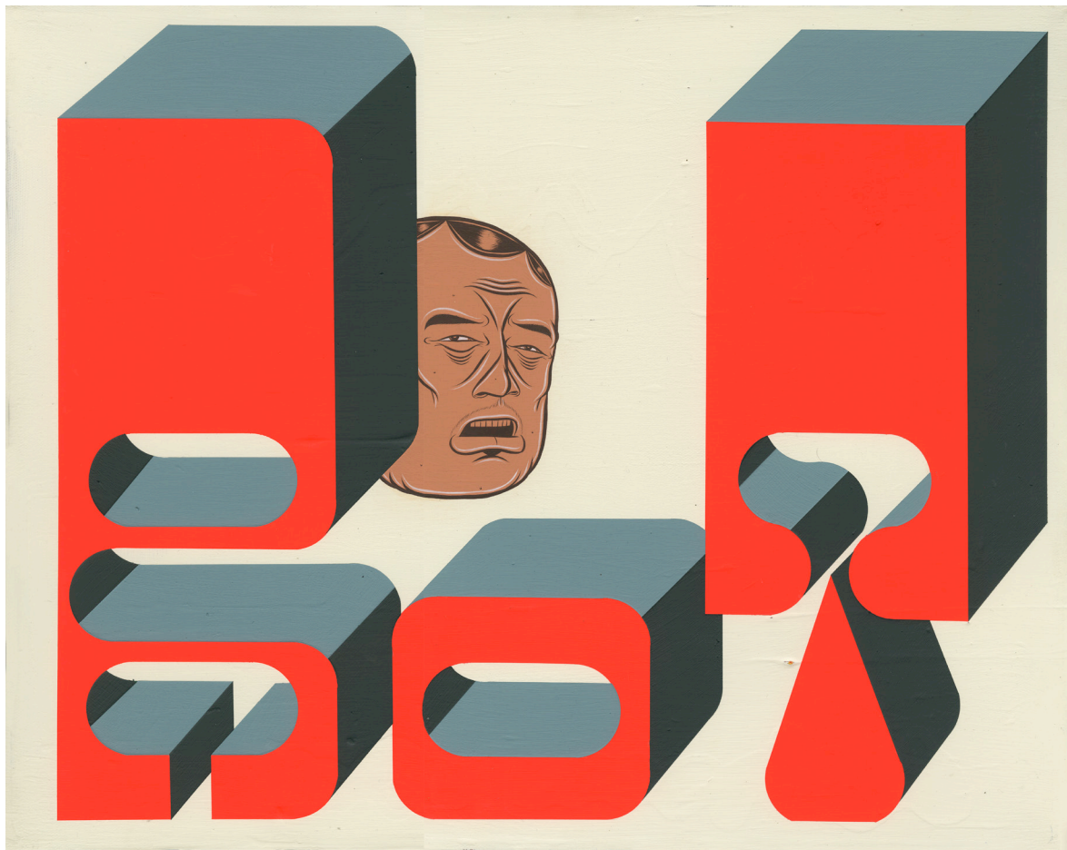
Image from zine. 獨立誌圖片。