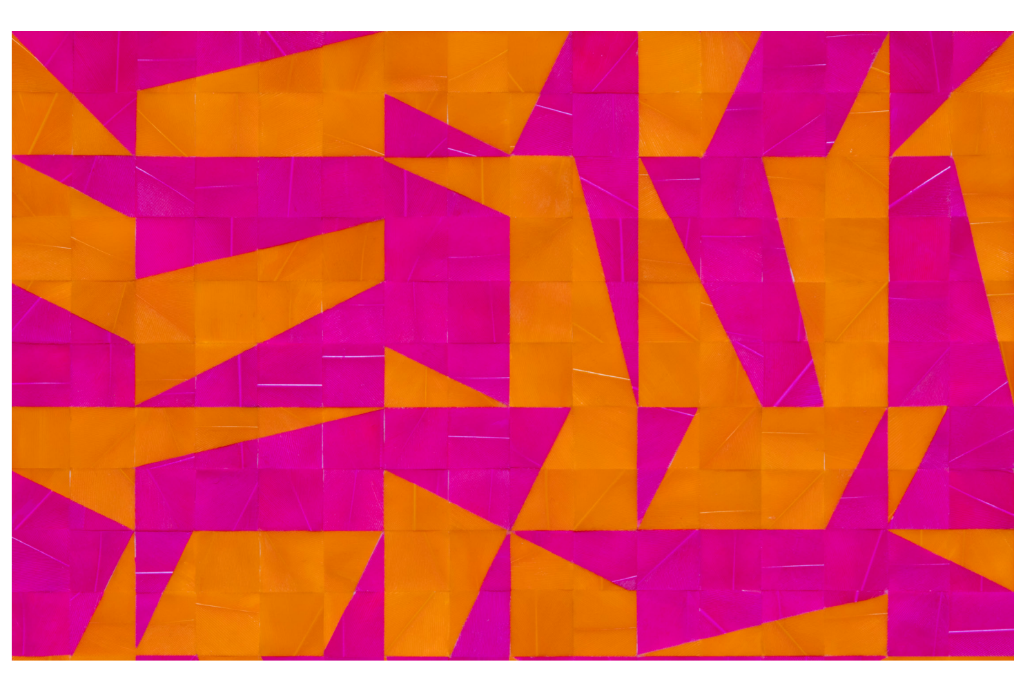
1,652 (detail), 2018. Feathers and pigment on museum cardboard. Unframed : 34 x 34 cm | 13 3/8 x 13 3/8 in. Framed : 60 x 60 x 4 cm | 23 5/8 x 23 5/8 x 1 9/16 in