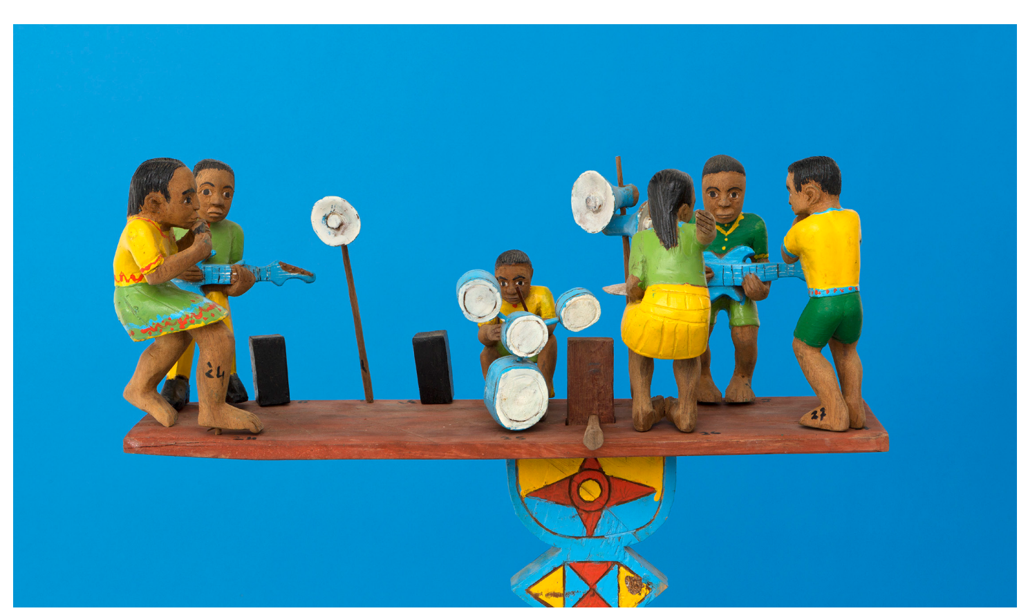
Jean Terry Efiaimbelo, "Tsapiky music band" 2016. Wood, paint. 177 x 54 x 20 | 69 11/16 x 21 1/4 x 7 7/8 in.