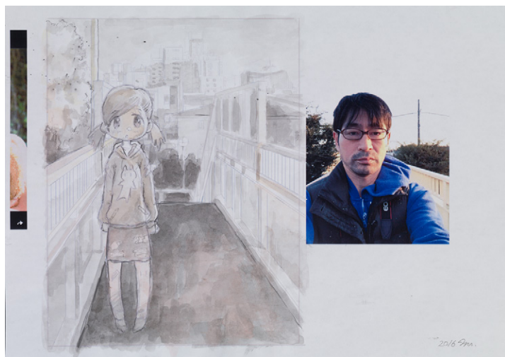
On a Pedestrian Overpass , 2016. Watercolor, pen and pencil on paper. 21 x 29.7 cm | 8 1/4 x 11 11/16 in. ©2016 Mr./Kaikai Kiki Co., Ltd. All Rights Reserved. Courtesy Perrotin

藝術博物館, 2014年); 《Sweet!》(貝浩登(香港), 2013年); 《Kyoto-Tokyo: From Samurais to Mangas》(摩納哥格利馬爾蒂會議展覽中心, 2010年); 《Animate》(日本福岡亞洲藝術博物館, 2009年); 《KRAZY! The Delirious World of Anime + Comics + Video Games + Art》(溫哥華美術館, 2008年); 《RED HOT: Asian Art Today from the Chaney Family Collection》(休斯敦美術博物館, 2007年); 《Chiho Aoshima, Mr., Aya Takano》(法國里昂現代藝術博物館, 2006年); 《Little Boy: The Arts of Japan's Exploding Subculture》(紐約日本協會, 2005年)。此外, Mr. 的作品也獲不同博物館永久收藏, 例如費城藝術博物館及西雅圖藝術博物館。