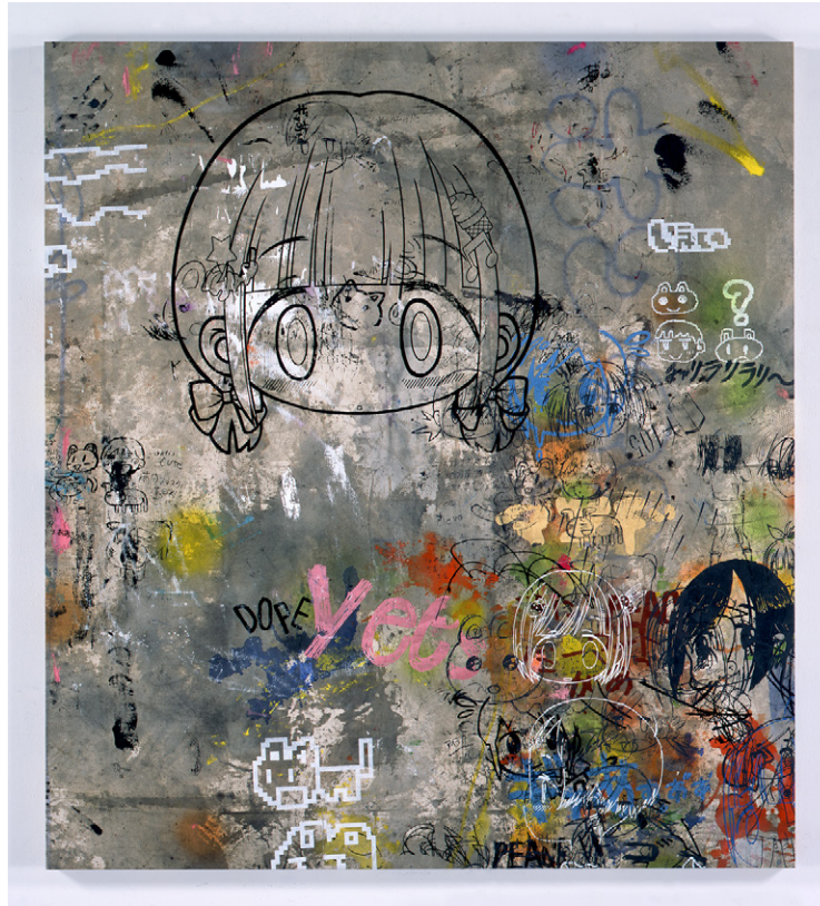
15:53 While Listening to Tokyo Broadcast Station Radio, 2017. Acrylic on linen mounted on wood panel. 180.2 x 162 cm | 70 15/16 x 63 3/4 in. ©2017 Mr./Kaikai Kiki Co., Ltd. All Rights Reserved. Courtesy Perrotin