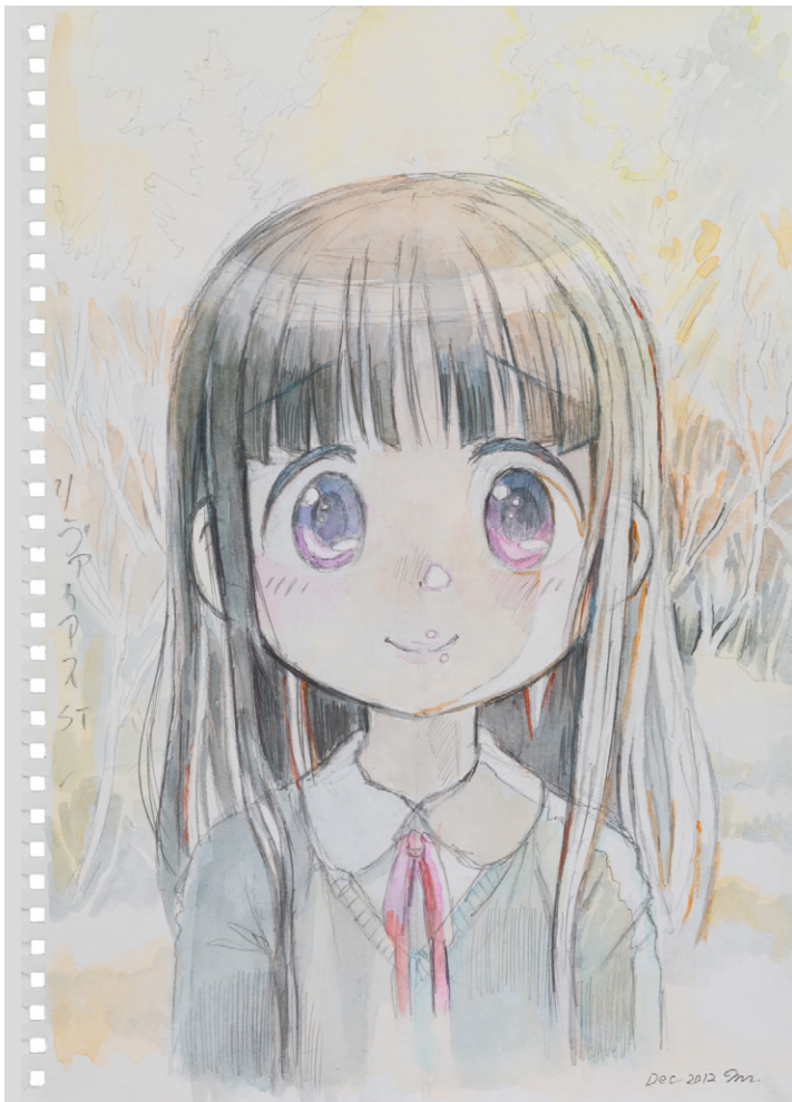
I Stopped By on My Way Home from After School Club , 2012. Watercolor, pen and pencil on paper. 28.6 × 20.2 cm | 11 1/4 × 7 15/16 in. ©2012 Mr./Kaikai Kiki Co., Ltd. All Rights Reserved. Courtesy Perrotin