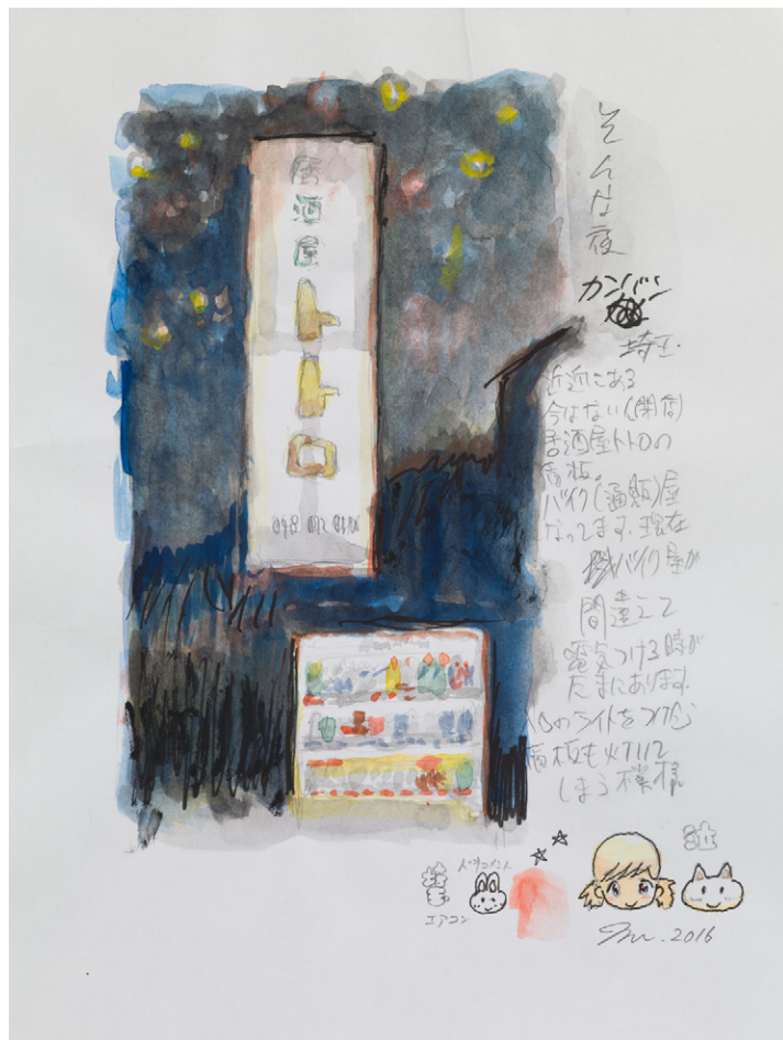
Izakaya Totoro , 2016. Watercolor, pen and pencil on paper. 23 x 17.5 cm | 9 1/16 x 6 7/8 in. ©2016 Mr./Kaikai Kiki Co., Ltd. All Rights Reserved.