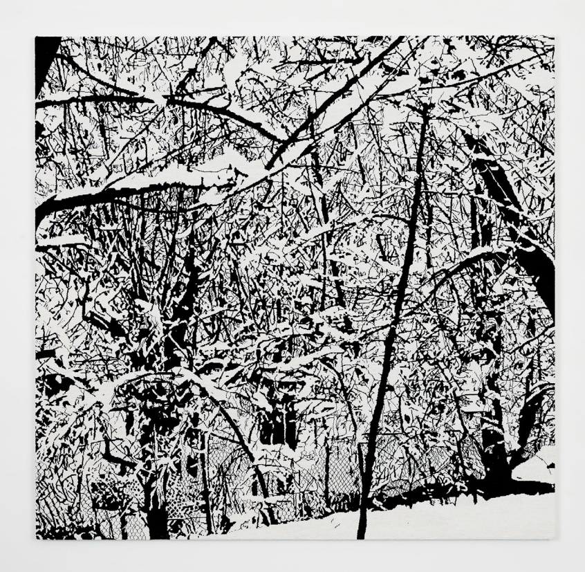
Snow Forest 003A, 2017. Hand embroidered beads on canvas. 179 \times 185 cm / 70 ^{1/2} \times 72 ^{13/16} in