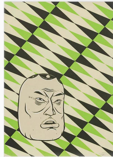
Barry McGee - Untitled . Produced by Underdogs Gallery, 2023. Screenprint on Astropack white 320g/m2 paper. 66 x 47 cm. Edition of 100 + 15AP, signed and numbered by the artist