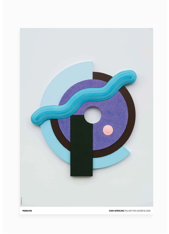
Josh Sperling - Follow The Leader B , 2020 (Standard Poster). Produced by Perrotin, 2020. Offset print. 70 × 50 cm / 27,5 × 19,6 in.