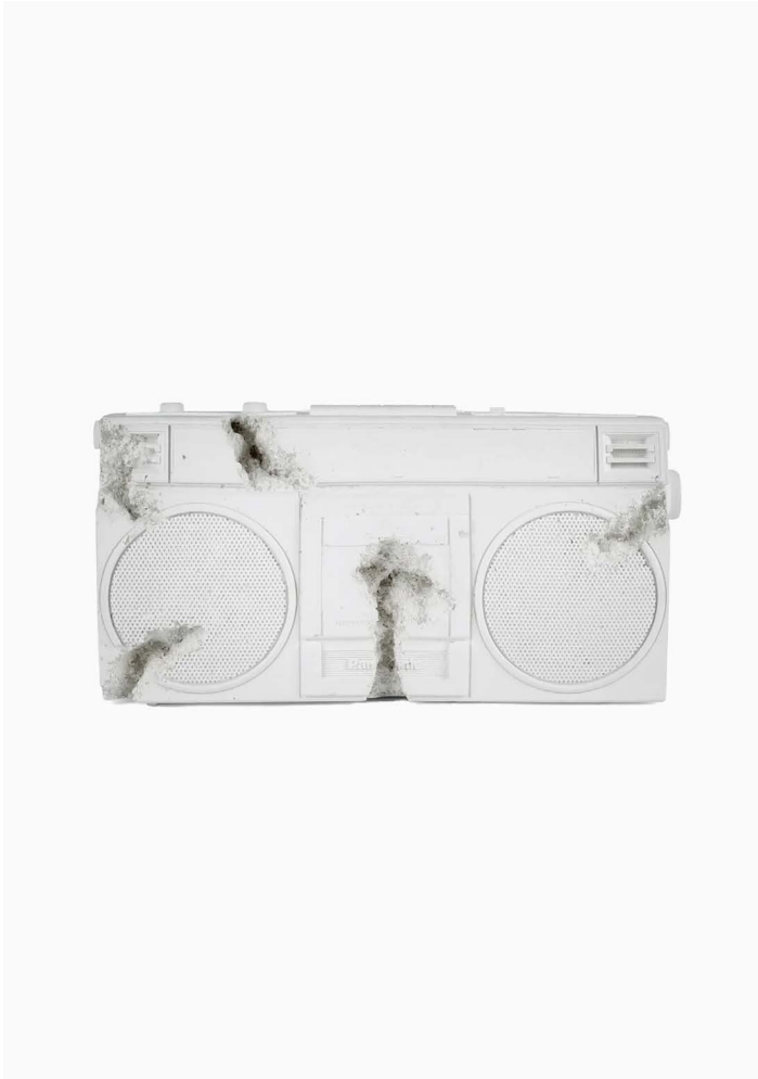
Daniel Arsham - Future Relic 08 (Radio). Produced by Arsham Editions, 2017. Weight: 10,5 kg. Dimensions: 20,3 × 40,6 × 12,7 cm. Limited edition of 500.