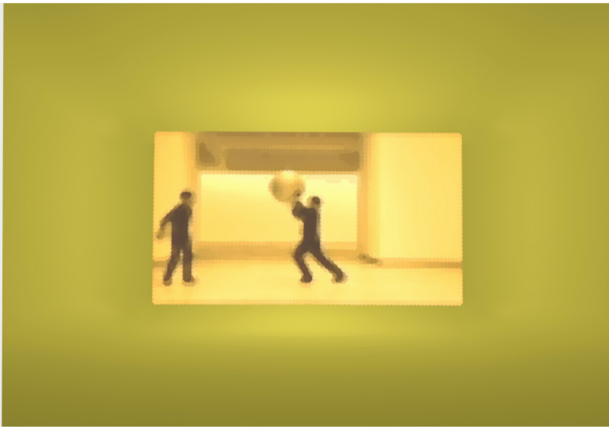
鸟雀No.4 L'Oiseau n°4 , 2023. 桦木胶合板、丙烯 | Birch plywood, acrylic paint. 40 x 40 x 2.5 cm. 雕塑公园 Sculpture Park , 2023. 虚拟现实体验作品静帧截图 | VR experience still.