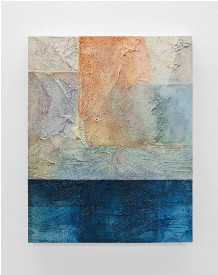
Correction , 2021. Cast gypsum, ink. 20 × 16 × 1 ½ inch.