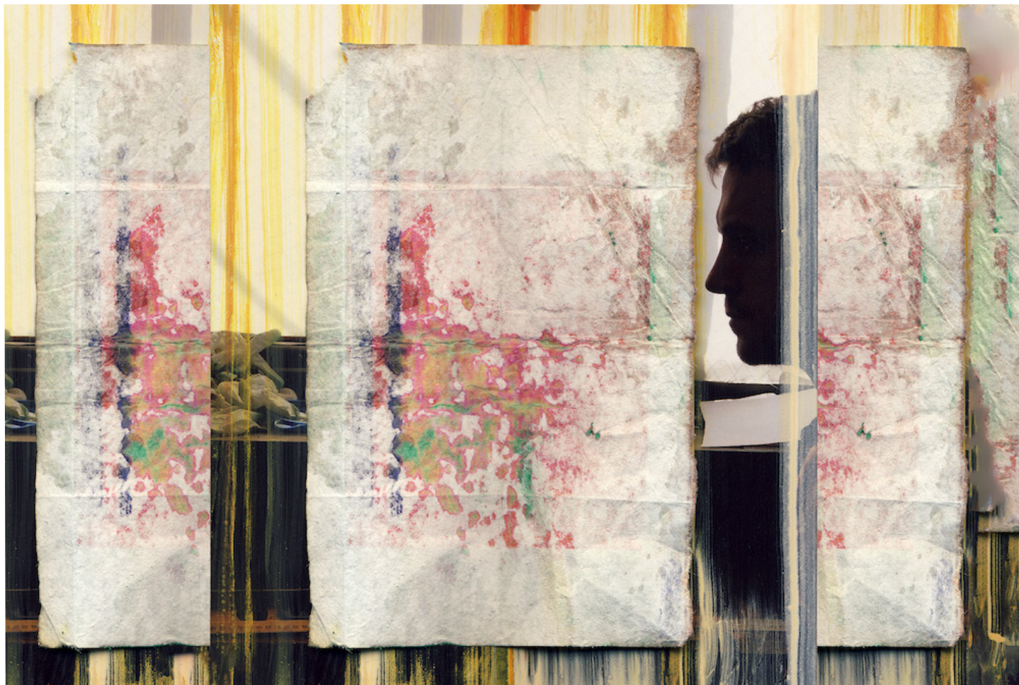
Detail of Flowers (retouched) , 2023. Colored photograph, frame. 24 × 28 ½ inch.