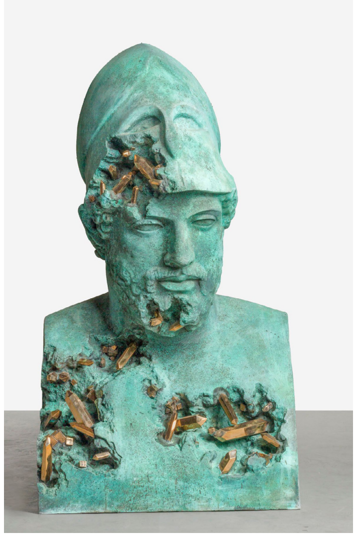
Daniel Arsham, Bronze Eroded Bust of Pericles, 2021. Bronze, polished stainless steel. 199\times107\times97 cm.