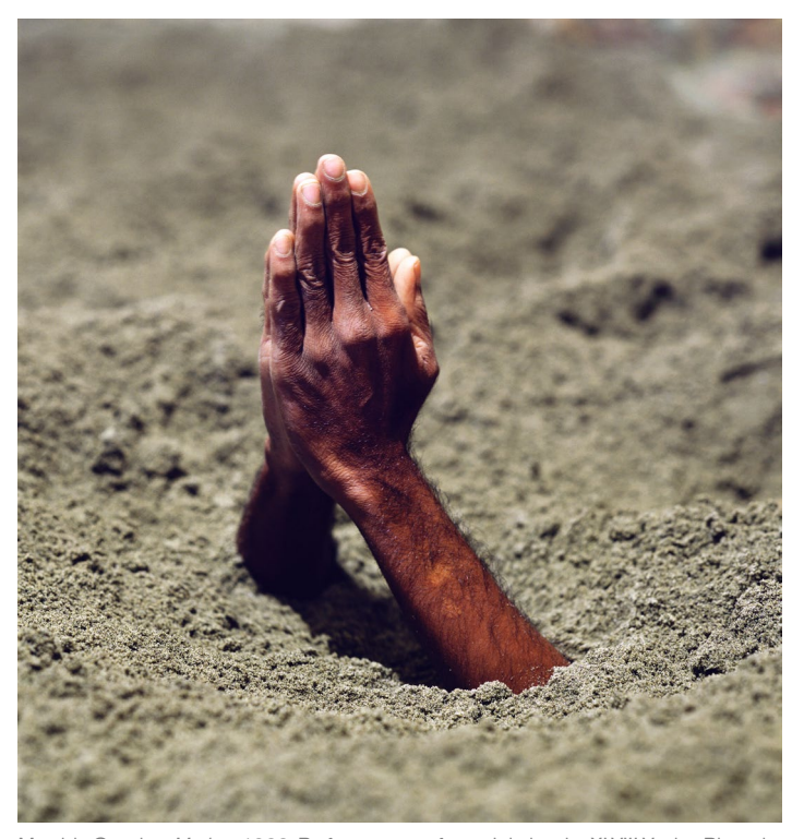
Maurizio Cattelan, Mother , 1999. Performance performed during the XLVIII Venice Biennale.