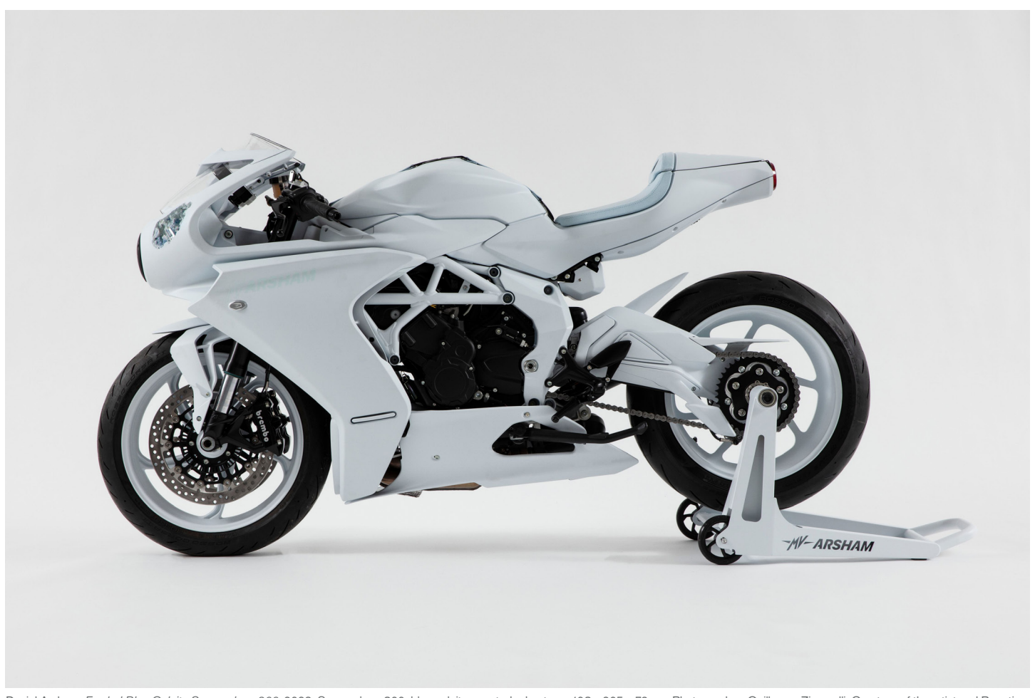
Daniel Arsham, Eroded Blue Calcite Superveloce 800, 2023. Superveloce 800, blue calcite, quartz, hydrostone. 108 × 205 × 79 cm.