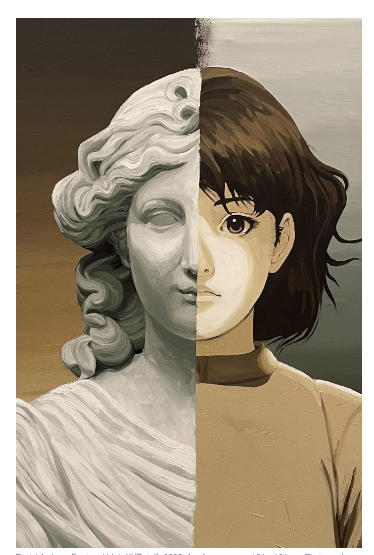
Daniel Arsham. Fractured Idols XI (Detail), 2023. Acrylic on canvas. 131 \times 121 cm.

Daniel Arsham's uchronic aesthetics revolves around his concept of fictional archaeology. Working in sculpture, architecture, drawing and film, he creates and crystallizes ambiguous in-between spaces or situations, and further stages what he refers to as future relics of the present. They are eroded casts of modern artifacts and contemporary human figures, which he expertly makes out of some geological material such as sand, selenite or volcanic ash for them to appear as if they had just been unearthed after being buried for ages. Always iconic, most of the objects that he turns into stone refer to the late 20th century or millennial era, when technological obsolescence unprecedentedly accelerated along with the digital dematerialization of our world. While the present, the future and the past poetically collide in his haunted yet playful visions between romanticism and pop art, Daniel Arsham also experiments with the timelessness of certain symbols and gestures across cultures.