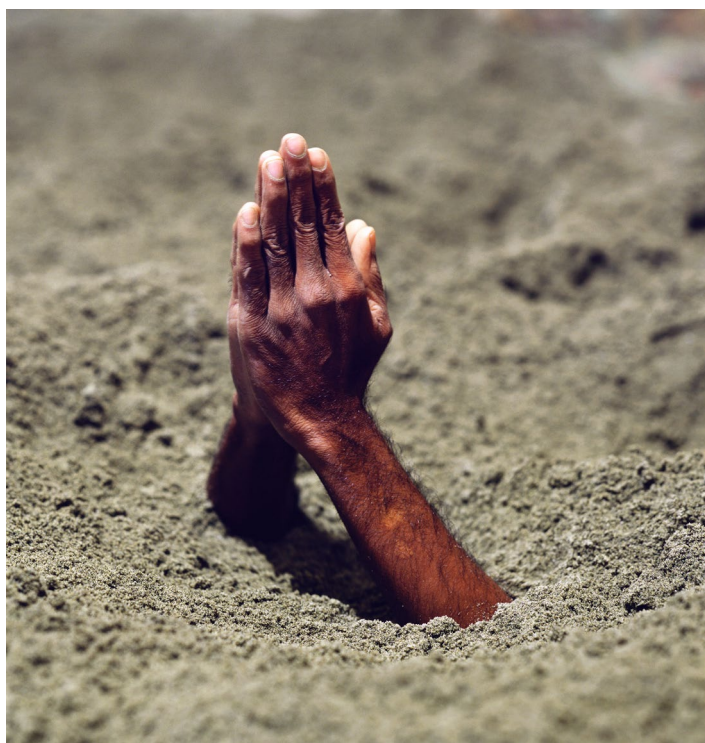
Maurizio Cattelan, Mother , 1999. Performance performed during the XLVIII Venice Biennale.