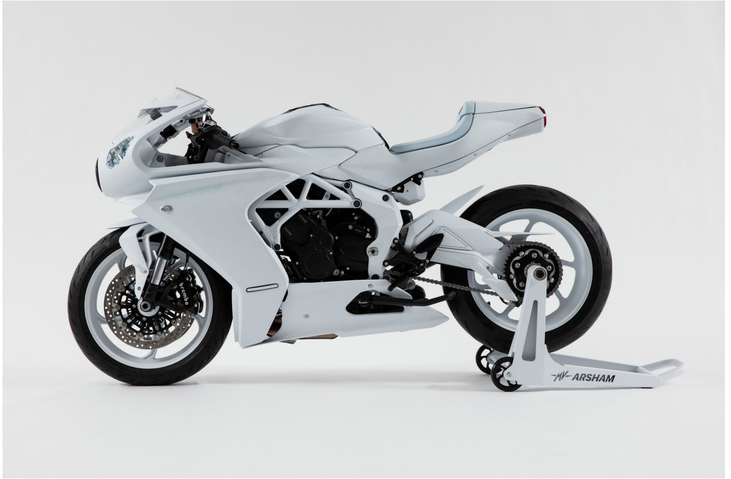
Daniel Arsham, Eroded Blue Calcite Superveloce 800 , 2023. Superveloce 800, blue calcite, quartz, hydrostone. 108 x 205 x 79 cm.