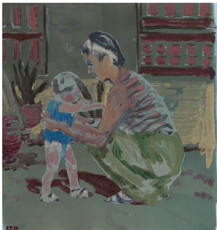
Claire Tabouret, Untitled . Photo: Marten Elder. ©Claire Tabouret/ ADAGP Paris, 2023. Courtesy of the artist and Almine Rech.

The Pavilion content spans across workshops, installations, dance, cinema, performance and painting. Inside it, everything is the result of an energy that challenges artistic and prison conventions, where pragmatic projects intertwine with the creativity of worlds usually lying parallel,