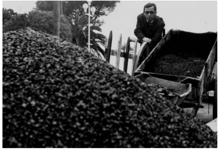
Bernar Venet in front of a pile of coal mixed with tar, avenue Albert 1er, Nice, 1963.

These proto-conceptual works already announce the dynamic of constant questioning that characterizes the artist's entire oeuvre.