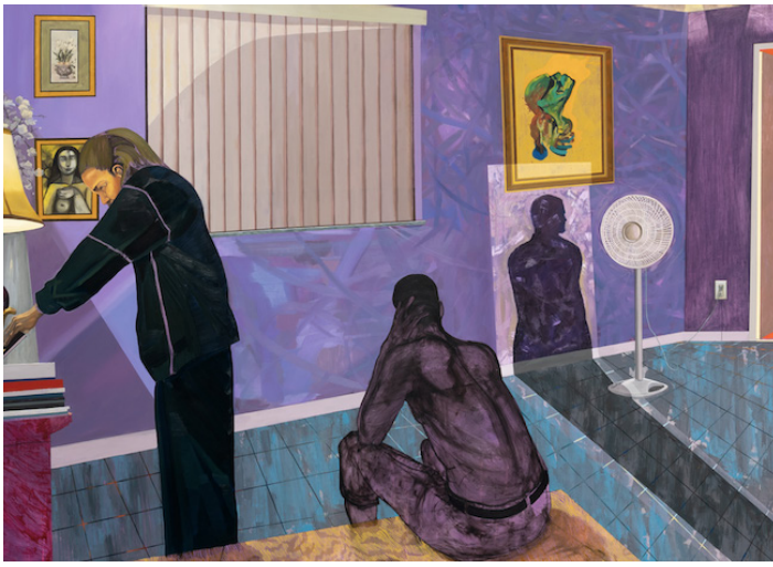
Erick Alejandro Hernández. Purple Room (detail), 2023. Oil on canvas. 198.1 x 274.3 cm.