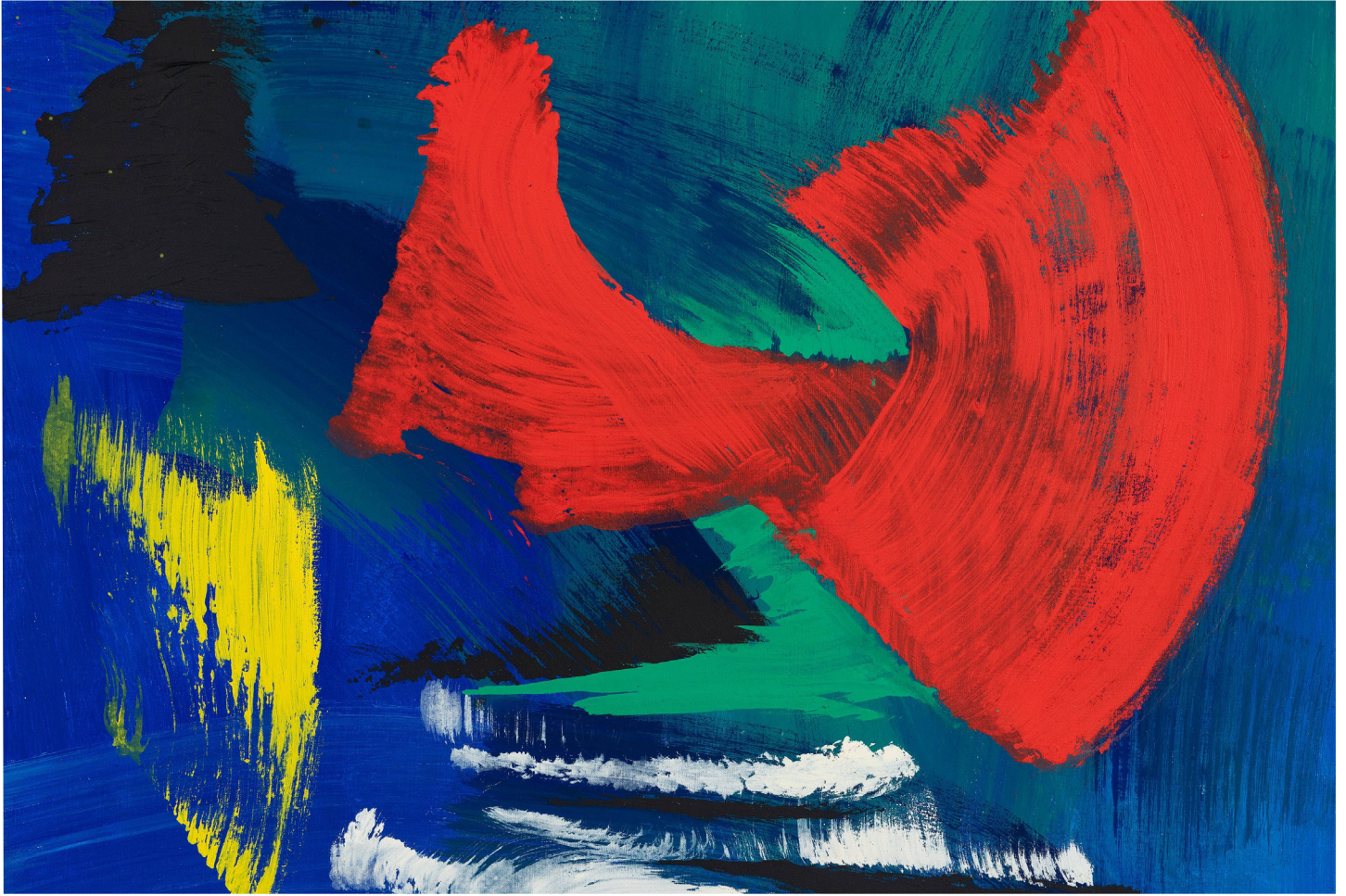
Sans titre (detail), 1985. Acrylic on paper mounted on cardboard mounted on stretcher. 31 7/8 x 39 3/8 inch. ©Schneider / ADAGP, Paris & ARS, New York, 2023. Courtesy of the Estate of Gérard Schneider and Perrotin.