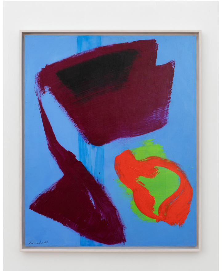
Opus 85 i, 1969. Acrylic on canvas. 39 3/8 × 31 7/8 inch.