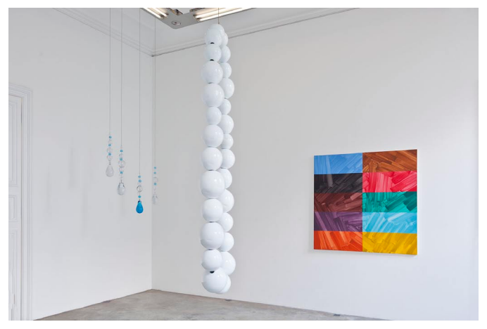
de gauche à droite / from left to right: Jean-Michel Othoniel «Larmes de verre» 2011 Verre de Murano, acier / Murano glass, steel approx. 65 x 12 x 12 cm (x7) / approx. 25 1/2 x 4 3/4 x 4 3/4 inches (x7)

Elmgreen & Dragset 's new sculptural work «Unfinished Symphony (Ich bin doch kein Mahler)» addresses the question of the unfinished - the beauty of the imperfection that can be found in something not yet completed - within the process of creating. The monumental and sculptural rough draft of the composer Gustave Mahler's head is placed on a grand piano, which is not yet varnished with the normal glossy black lacquer, but rather still appears in its original raw wood. This stripped-down version of a traditional bourgeois interior references Mahler's 10th Symphony, which remained unfinished after the composer's premature death at the age of 50. A four meter high bronze sculpture depicting a young boy on his rocking horse and on view until 2013 has been produced for The Fourth Plinth Commission 2012 in <u>Trafalgar Square in London</u>.