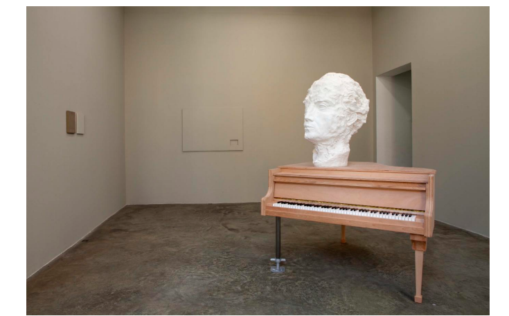
Elmgreen & Dragset « Unfinished Symphony (Ich bin doch kein Mahler) » 2012 Technique mixte / Mixed media 201 x 144 x 150 cm / 6.7 feet x 56 3/4 inches x 59 inches

Jean-Michel Othoniel «Le Collier Blanc» 2012 Verre de Murano, acier / Murano glass, steel 191 x 57 x 18 cm / 6.3 feet x 22 1/2 inches x 7 inches