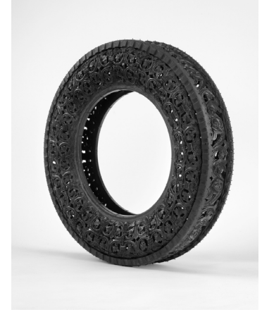
Wim Delvoye Sans titre / Untitled 2011 Pneu de voiture taillé à la main / Handcarved car tyre ø 68 x 13 cm / ø 26 3/4 x 5 1/4 inches

The exhibition will also comprise a new work by Lionel Estève (Untitled, 2012); two paintings by Bernard Frize (« Calu », 2011 and « Vestal », 2008); a work by Gelitin (Untitled, 2012); an installation by Guy Limone (« 160 out of every 1000 Americans own a passeport », 2007); a new series of five photographies by Kolkoz ; a sculpture by Klara Kristalova (« Still remaining », 2012); a new painting by Takashi Murakami (« The Singularity of Fate: Counting Teary-Eyed Stars... », 2011); a triptych by Paola Pivi (Untitled, 2005); a film (« Drumball », 2003/2011) and two sculptures from the series « The Architects » (« Philippe Bona » et « Elisabeth Lemercier », 2009) by Xavier Veilhan .