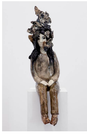
Klara Kristalova « Still remaining » 2012 Grès émaillé / Glazed stoneware 88 x 26 x 38 cm / 34 3/4 x 10 1/4 x 15 inches