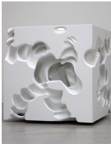
Six erosions to the center (3) , 2010 Polystyrène, plâtre, peinture 122 x 122 x 122 cm