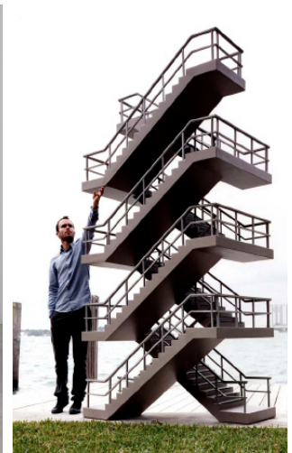
Open Staircase , 2006 Epoxy foam, PVC, epoxy resin 335 x 106 x 86 cm / 132 x 42 x 34 inches