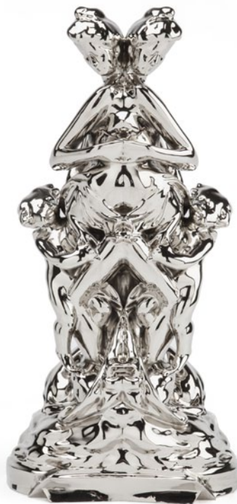
"Gloria Victis Rorschach" 2012, Nickelated bronze, 44,4 x 21,3 x 29,6 cm 17 1/2 x 8 1/2 x 11 3/4 inches