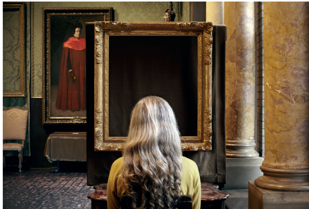
“What do you see ? The Concert. Vermeer.”, (detail) 2013 Colour photograph, text, frames (plexiglass and metal frames), 68 x 101 cm / 26 3/4 x 39 3/4 inches (each, photo and text)

The solo show “Rachel, Monique” will be presented in May 2014 at The Episcopal Church of the Heavenly Rest in New York.