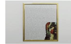
“Le Major Davel”, 1994 Silkscreen on Arches paper 162 x 148 cm 63 3/4 x 58 1/4 inches

On the night between August 24 and 25, 1980, the painting by Charles Gleyre, Major Davel , was partly destroyed by fire that ensued from an act of vandalism. All that remained of the canvas was the crying soldier in the bottom right-hand corner. I asked the curators, guards, and other staff members at the Musée Cantonal des Beaux-Arts in Lausanne to describe what they remembered of the missing part of the painting.