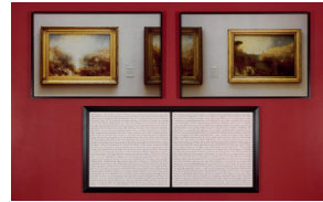
“Purloined : Turner”, 1998-2013 Two colour photographs, text, frames 90 x 127 cm / 35 1/2 x 50 inches (each photo) 90 x 170 cm / 35 1/2 x 67 inches (text) 15 x 20 cm / 6 x 7 3/4 inches (introduction text)

Following thefts involving a Lucian Freud painting and two Turners belonging to the Tate Gallery in London, a Picasso at the Richard Gray Gallery in Chicago, and a Titian from the Marquis of Bath's residence, Longleat House, I asked the curators, guards, and other staff members of the Museums, gallery or collection, to describe the missing works.