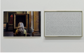
“What Do You See ? The Concert . Vermeer.”, 2013 Colour photograph, text, frames (plexiglass and metal frames) 68 x 101 cm / 26 3/4 x 39 3/4 inches (each, photo and text)