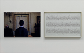
“What Do You See ? A Lady and Gentleman in Black . Rembrandt”, 2013 Colour photograph, text, frames (plexiglass and metal frames) 68 x 101 cm / 26 3/4 x 39 3/4 inches (each, photo and text)