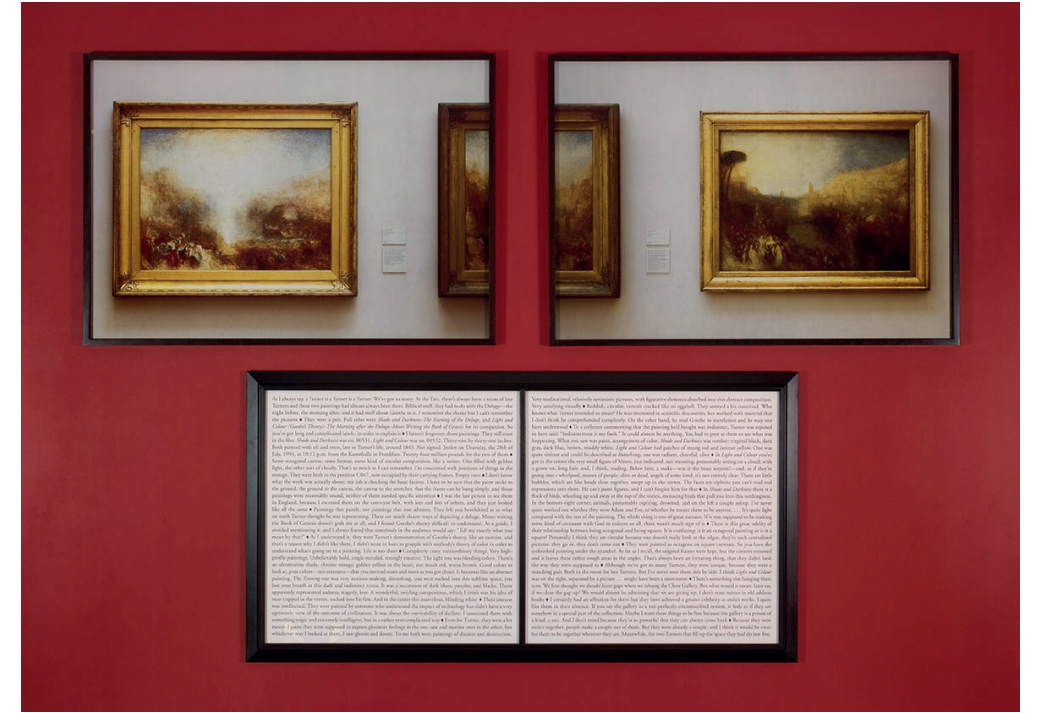
“Purloined : Turner”, 1998-2013 Two colour photographs, text, frames, 90 x 127 cm / 35 1/2 x 50 inches (each photo) 90 x 170 cm / 35 1/2 x 67 inches (text) 15 x 20 cm / 6 x 7 3/4 inches (introduction text)