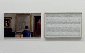
“What Do You See ? Storm on the Sea of Galilee . Rembrandt”, 2013 Colour photograph, text, frames (plexiglass and metal frames) 68 x 101 cm / 26 3/4 x 39 3/4 inches (each, photo and text)