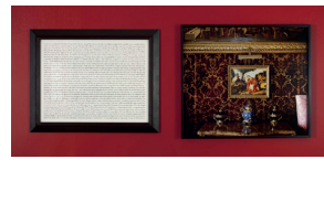
“Purloined : Titian, The Rest on the Flight into Egypt ”, 1998-2013 Colour photograph, text, frames 64,5 x 74 cm / 25 1/2 x 29 1/8 inches (photo) 60 x 74 cm / 23 1/2 x 29 1/8 inches (text) 15 x 20 cm / 6 x 7 3/4 inches (introduction text)