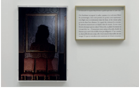
“What Do You See ? The Clairvoyant ”, 2013 Colour photograph, text, frames (plexiglass and metal frames) 51 x 34 cm / 20 1/16 x 13 1/2 inches (photo) 23,5 x 34 cm / 9 1/4 x 13 1/2 inches (text)