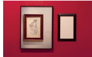
“Purloined : Picasso, Head ”, 1994 Colour photograph, text, frames 104 x 77 cm / 41 x 30 1/4 inches (photo) 66 x 44 cm / 26 x 17 1/4 inches (text) 15 x 20 cm / 6 x 7 3/4 inches (introduction text)