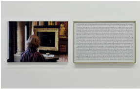
“What Do You See ? Landscape with an Obelisk . Flinck”, 2013 Colour photograph, text, frames (plexiglass and metal frames) 68 x 101 cm / 26 3/4 x 39 3/4 inches (each, photo and text)

On March 18, 1990, six paintings by Rembrandt, Flinck, Manet and Vermeer, five drawings by Degas, one vase, and one Napoleonic eagle were stolen from the Isabella Stewart Gardner Museum in Boston. The frames of the Rembrandt, Vermeer and Flinck paintings were left behind. In 1994, after being restored, the empty frames were hung back in place, further emphasizing the painting's absence. I asked the curators, guards, other staff members and visitors to tell me what they saw within these frames.