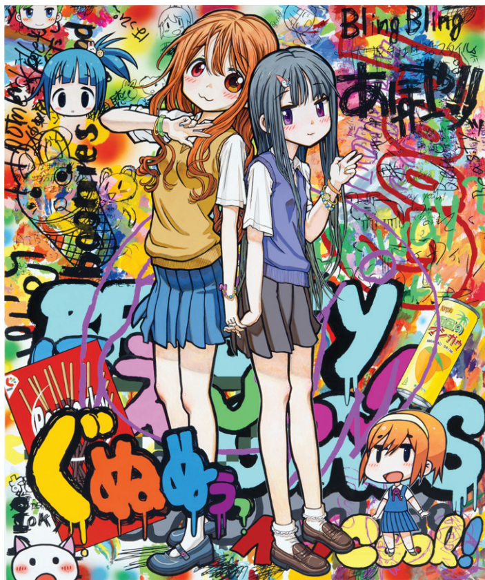
Untitled, 2013 Acrylic on canvas 194 x 162 cm / 6.4 feet x 5.3 feet