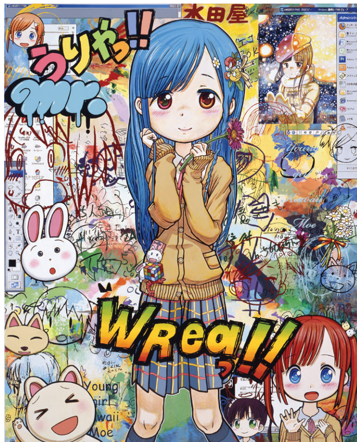
“Urryaa!! (Wreal!!)” 2013 Acrylic on canvas 162 x 130,3 cm / 63 3/4 x 51 1/4 inches ©2013 Mr./ Kaikai Kiki Co., Ltd. All Rights Reserved.

The exhibition at Galerie Perrotin, Hong Kong, from 4 October to 9 November brings together a new body of works, which invite us once again into his private fantasy world.