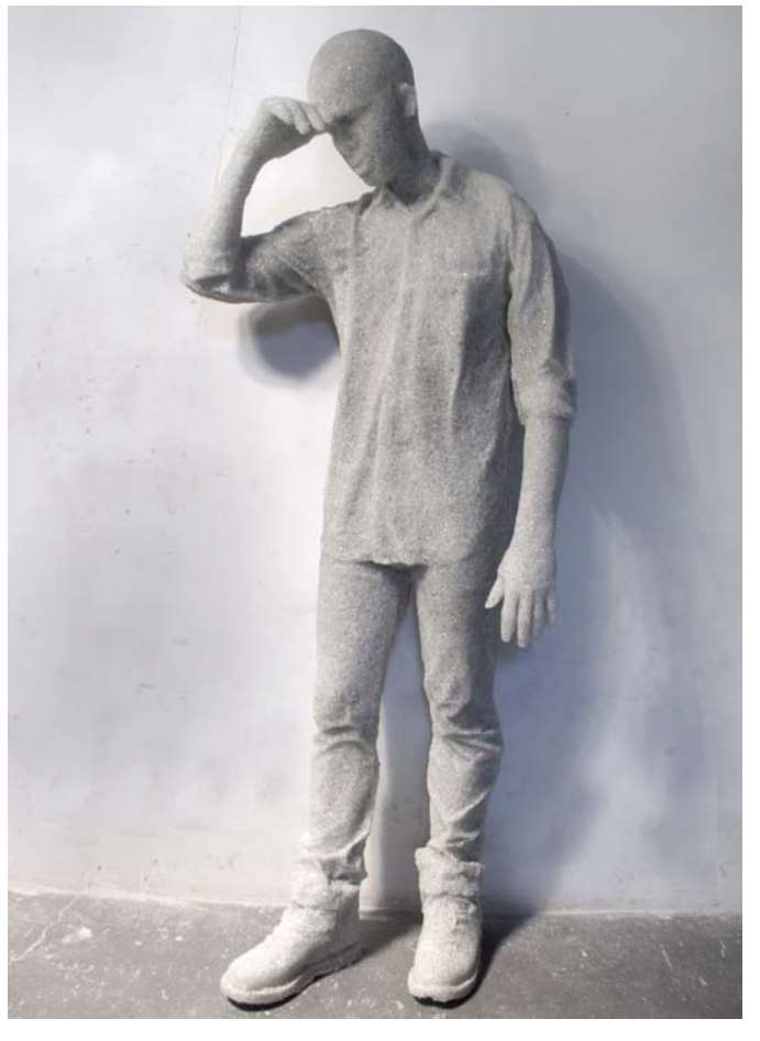
"Looking Ahead", 2013 Broken glass, resin 65 1/4 x 27 1/8 x 14 1/2 inches / 166 x 69 x 37 cm